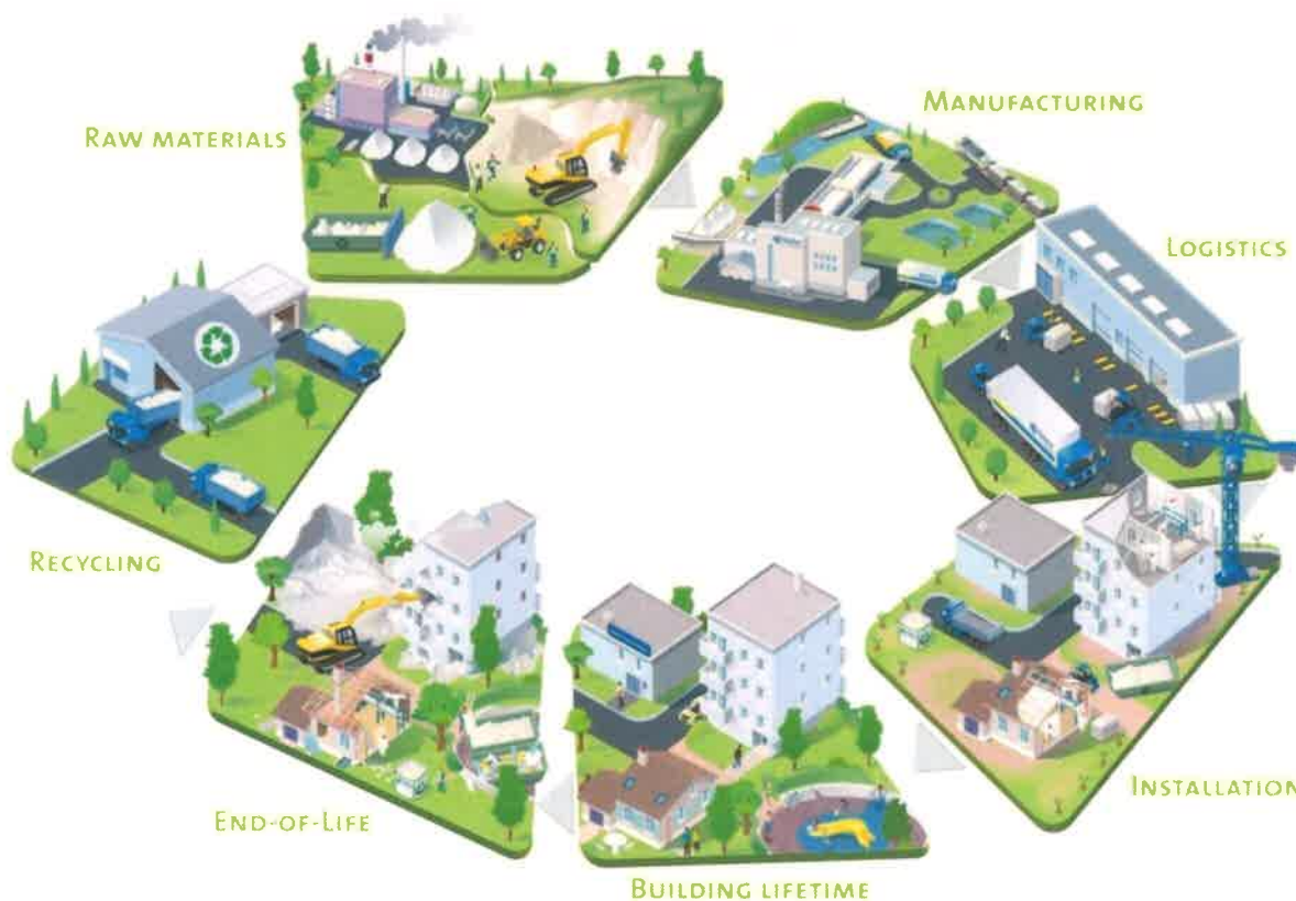
Flow diagram of the Life Cycle