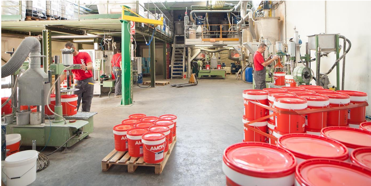
The products and the production plant

As before mentioned, the six products are not alternative and their environmental profiles are presented separately.